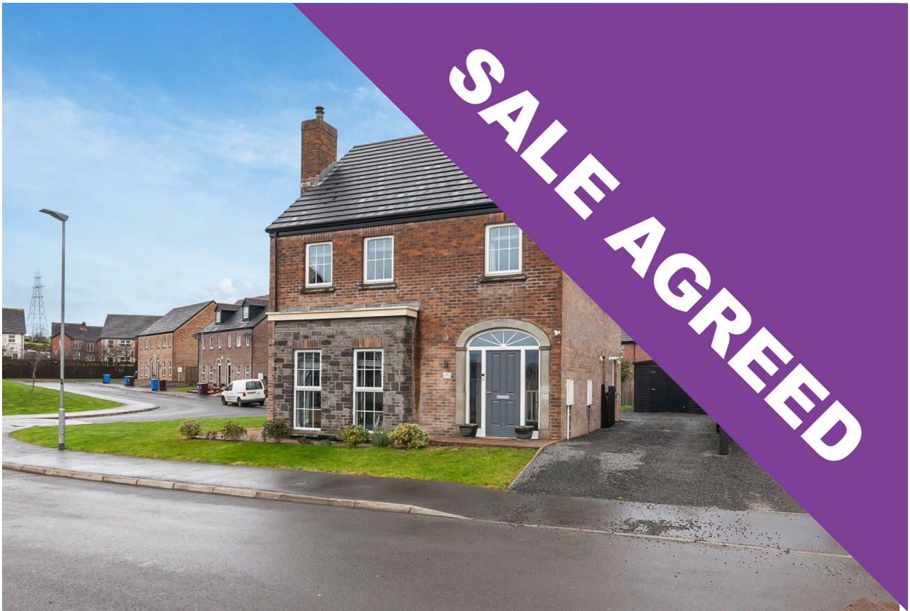
25 Clover Brook, Larne, BT40 2UP